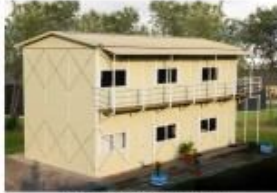
PRE ENGINEERED ACCOMMODATION