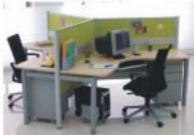
MODULAR FURNITURE & TURNKEY INTERIORS