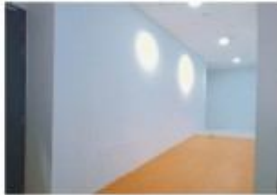
PARTITIONS, DRY WALL CONSTRUCTION