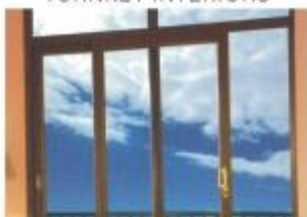
FENESTRATION DOOR / WINDOWS / FRAMES